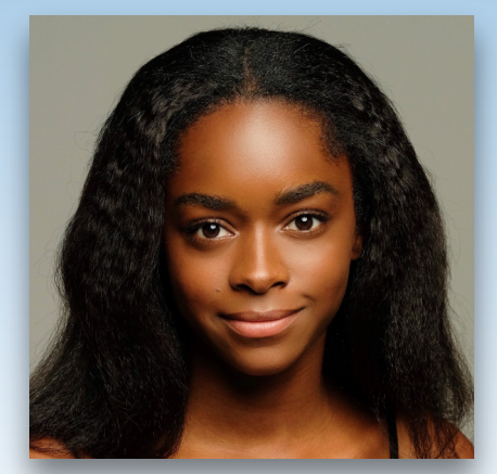
ActorsFCU Scholarship for the Creative Arts